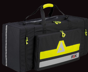
PAX Firefighter Kit Bag