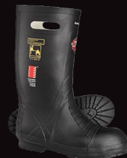
Skellerup Fire Fighter Extreme