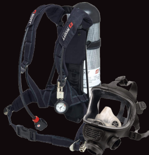
Scott Safety ProPak