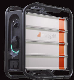
Kraken Power Instagrid