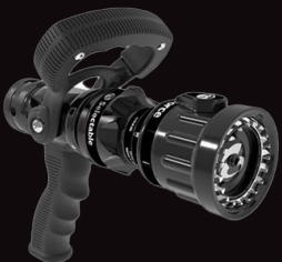
TFT G Force