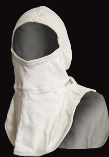
Stewart & Heaton Nomex Blend