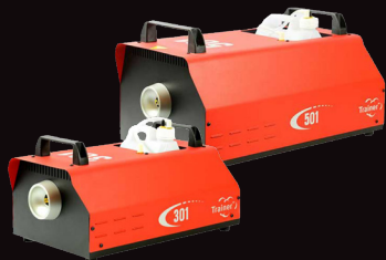
Trainer Smoke Machines