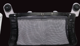
Fire Helmet Accessories and Replacements