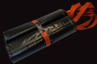
Bridgehill Forklift Standard