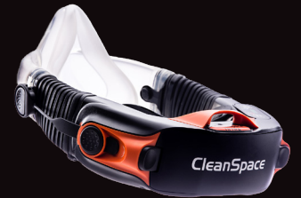
CleanSpace Ultra Half-Face Mask