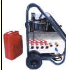
Shown with fuel tank detached